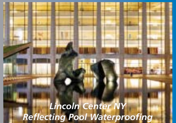
Lincoln Center NY Reflecting Pool Waterproofing