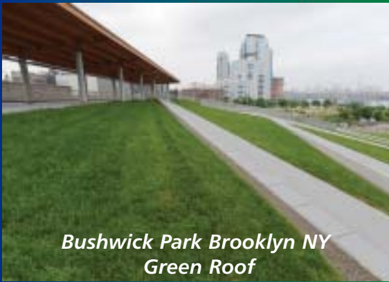
Bushwick Park Brooklyn NY Green Roof

Pumadeq Balconies; Buried Waterproofing; Traffic Coatings; Decorative Coatings; Roofing Systems