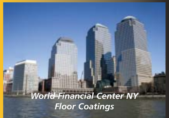
World Financial Center NY Floor Coatings

Qontain Reflecting Pools; Water Containment; Retention Vaults; Water Features; Fountains