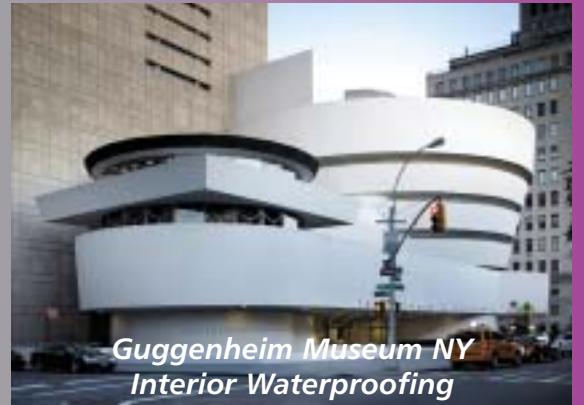
Guggenheim Museum NY Interior Waterproofing

Buried Waterproofing; Elevator Pits; Wet Areas; Interior Waterproofing