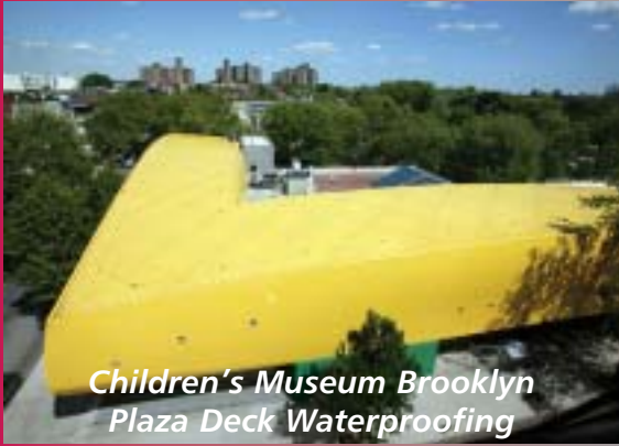
Children's Museum Brooklyn Plaza Deck Waterproofing