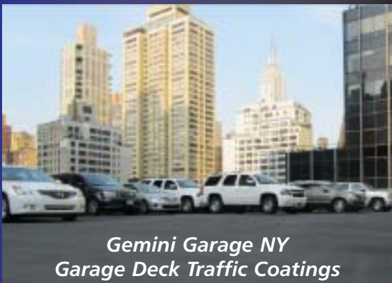
Gemini Garage NY Garage Deck Traffic Coatings

Prodeq Plaza Decks; Green Roofs; Split Slabs; Set Backs; Terraces; IRMA Roofs; Ballasted Roofs