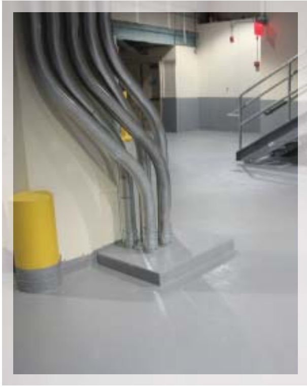
Mechanical Room, Manhattan, NY; 2014

The result is an easy to specify, fast applied, more durable and long lasting waterproofing. All backed by a single source, 10 year, NDL, labor and material warranty.