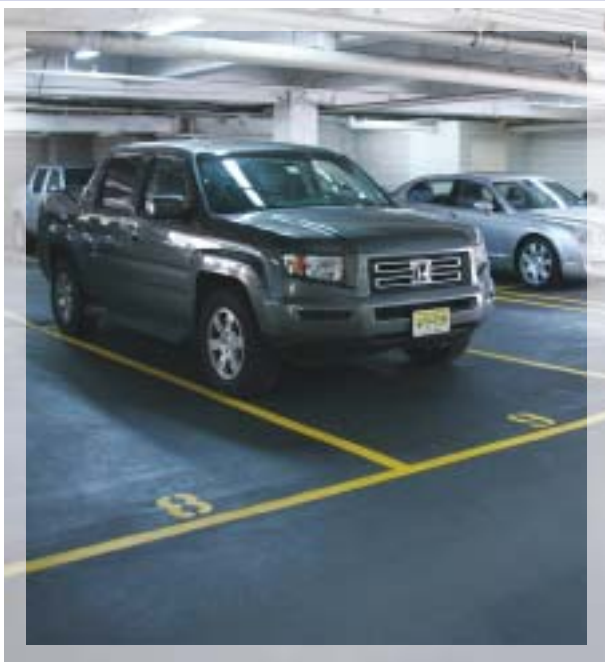
Lower Deck Parking, Manhattan, NY; 2002