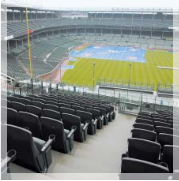
Bleacher Waterproofing, Chicago, IL; 2008